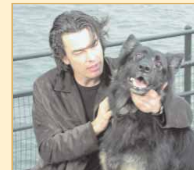
Actor Peter Gallagher from The O.C., spending time with Piper during a visit to Lower Manhattan.

"My experiences with this K-9 team opened up a whole new area of my life. I know what faith really means. I have a partner who asks nothing of me except to stay at my side and do his work. And when he's tired or hurting he works even harder. In my next life, I would like to be that good."